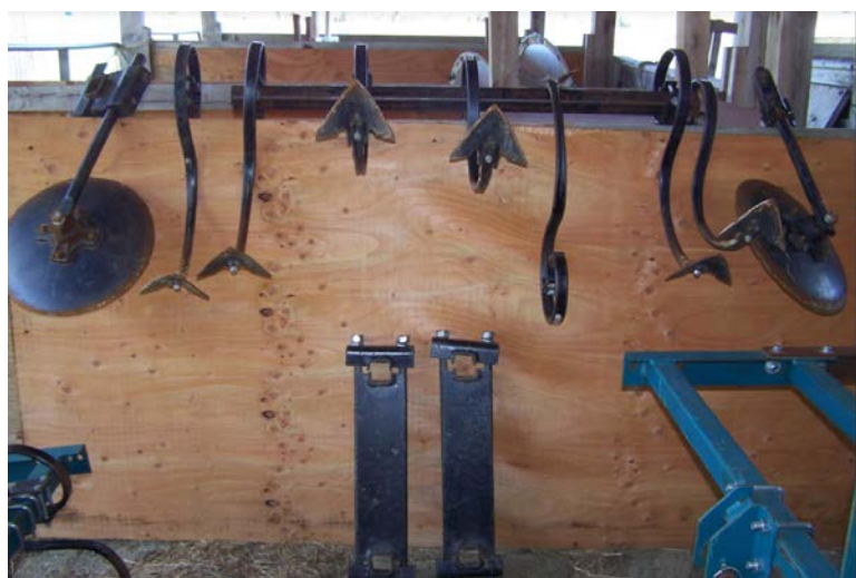
Cultivating Equipment - This is a collection of cultivating equipment including 2 discs, 5 harrow and couplers to attach it the existing equipment like the strip tiller.