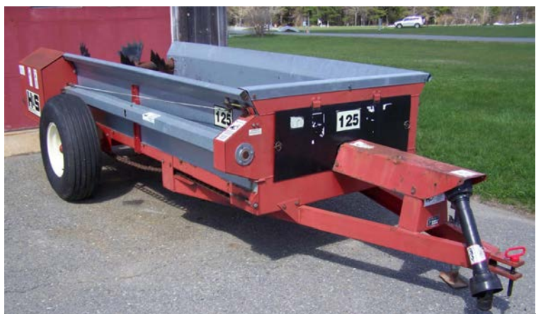
Manure/Compost Spreader - This is a 125 bushel spreader with a PTO drive that will work on a 25 HP tractor or more. It is road worthy up to 25mph or else requires a trailer for transport.