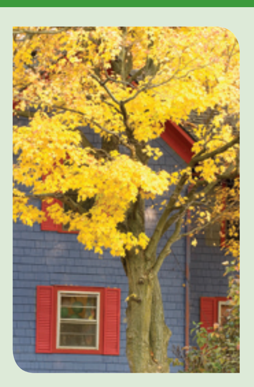
Well-placed trees can help homeowners save energy by shading their homes.

Choose trees for the long run. Not all trees are equally effective at storing carbon. Trees that grow larger will store more carbon over their lifetimes than smaller trees, and faster-growing trees accumulate carbon faster. Opt for native, long-