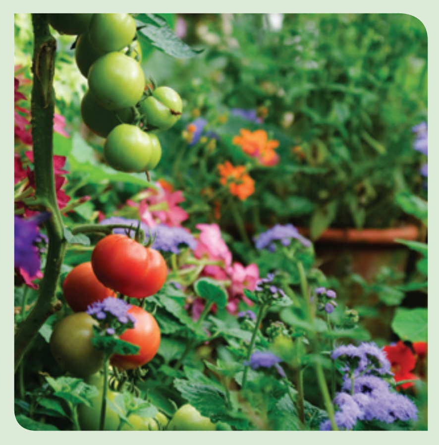
Most supermarket produce travels more than 1,500 miles to get to your dinner plate. Growing food in your garden eliminates some of that transportation and its heattrapping emissions.

Incorporating fruit trees and berry bushes into your yard instead of purely ornamental plants increases the amount of food you can grow. And homegrown produce is fresher and better-tasting because it's picked ripe and usually eaten within hours of harvest.