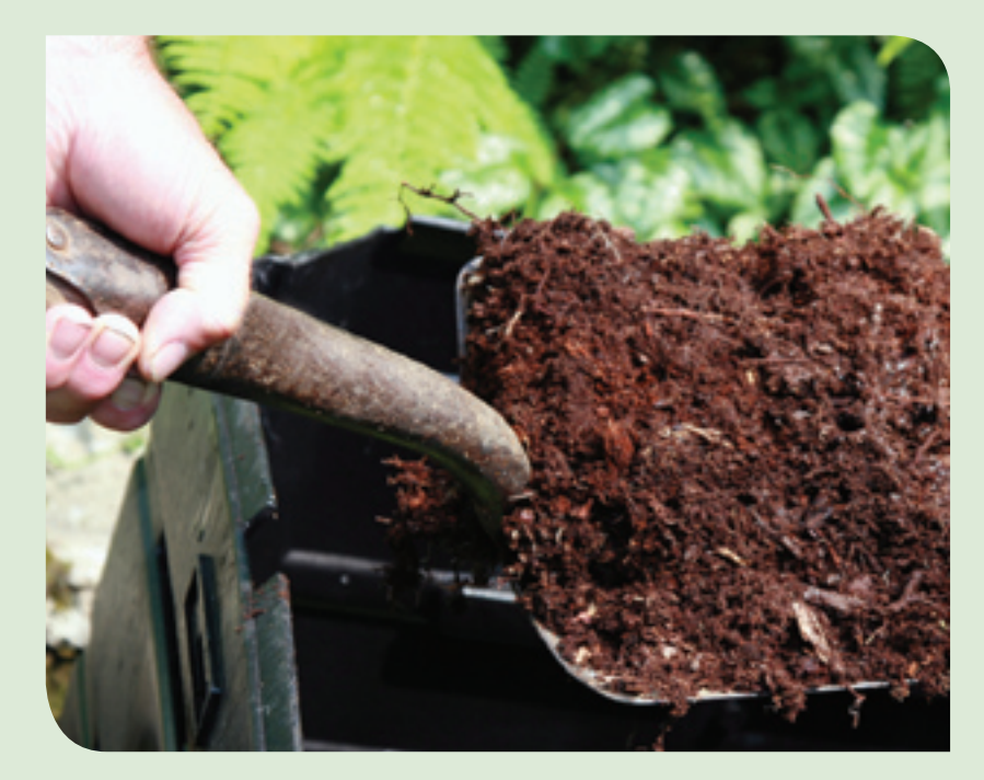
Turning garden and kitchen waste into compost reduces heat-trapping methane emissions from landfills, improves your garden's soil, and helps it store carbon.

To read more about the science of composting and tips for choosing a system appropriate for your yard, visit the University of Illinois Extension website ( http://web.extension.illinois.edu/homecompost/intro.html ).